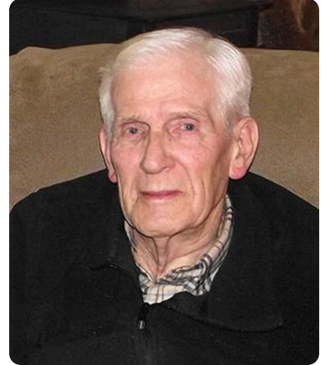
What a handsome man!